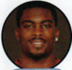
Mike Vick Falcons QB $13 million