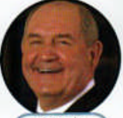
Sonny Perdue Governor $128,903