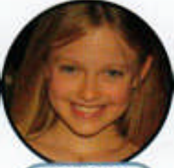
Dakota Fanning Actress $3 million