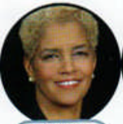
Shirley Franklin Mayor $141,500